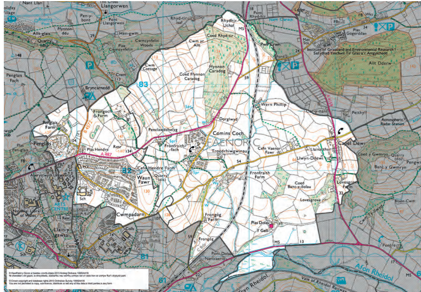
Ni chaniateir i chi gopio, is-drwyddedu, dosbarthu neu werthu unrhyw ran o'r data hwn ar unrhyw ffurf i drydydd parti.

Yr ardal a wasanaethir gan Gyngor Cymuned y Faenor